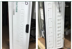
Assorted Chevy Silverado Tailgates Three