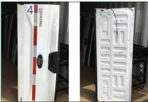
Ford F150 Tailgate