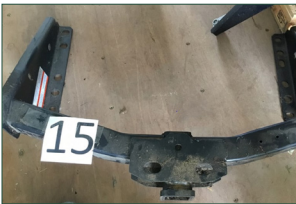
Ford Trailer Hitch V-5 8,000 Max Gross Trailer Weight Carrying