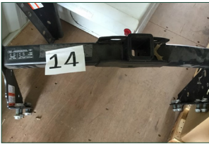
Ford Trailer Hitch V-5 8,000 Max Gross Trailer Weight Carrying