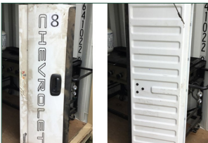
Chevy Tailgate, Unknown Model