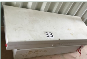
Truck Tool Box