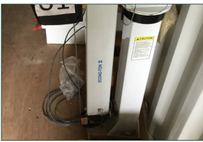
Econo-Ton II Auto Crane